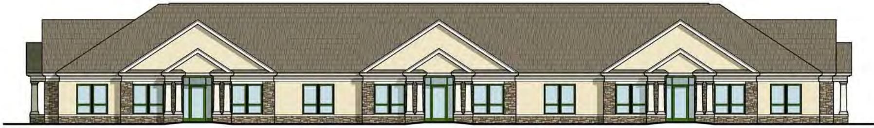
2 FRONT ELEVATION SCALE: 1/8" = 1'-0"