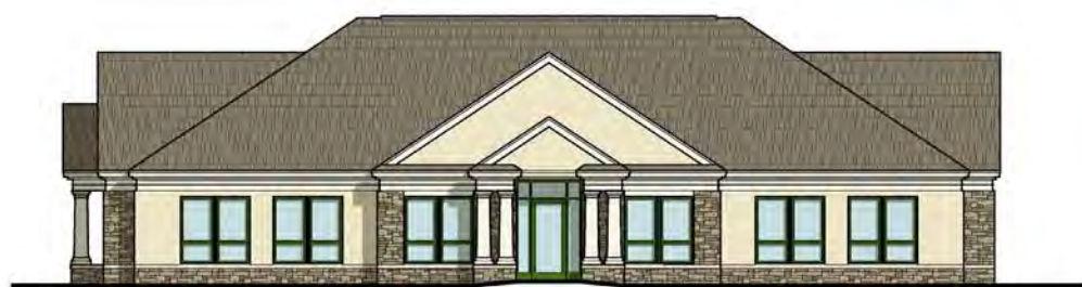
4 SIDE ELEVATION SCALE: 1/8" = 1'-0"

PROPOSED Lexington Mews Town Center at Weatherby for Nexus Properties Block 3 Lot 7.02 Township of Woolwich Gloucester County, New Jersey PROJ. NO: 1069.01 DATE: 10-1-04 DRAWN BY: sgg CHECKED BY: gbk DRAWING TITLE: Plan & Elevations