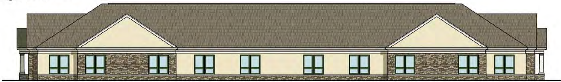
3 REAR ELEVATION SCALE: 1/8" = 1'-0"