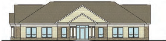
2 SIDE ELEVATION SCALE: 1/8" = 1'-0"