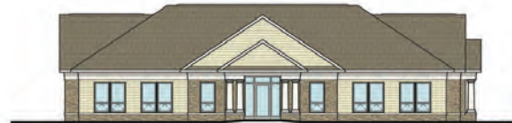
3 SIDE ELEVATION SCALE: 1/8" = 1'-0"