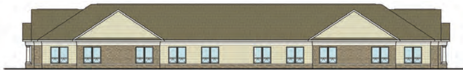
4 REAR ELEVATION SCALE: 1/8" = 1'-0"